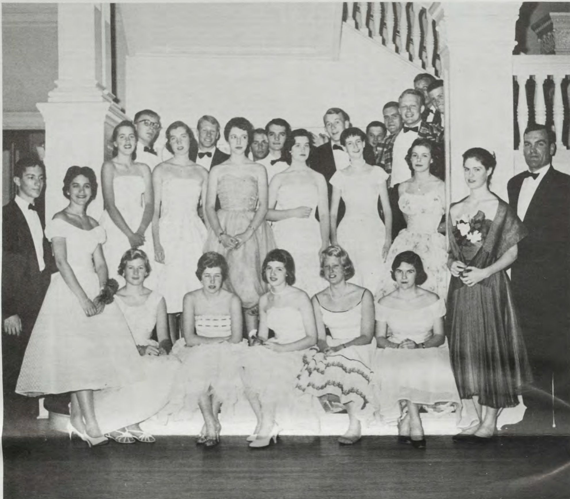
The Junior Class and Escorts Twenty-five years ago this spring.