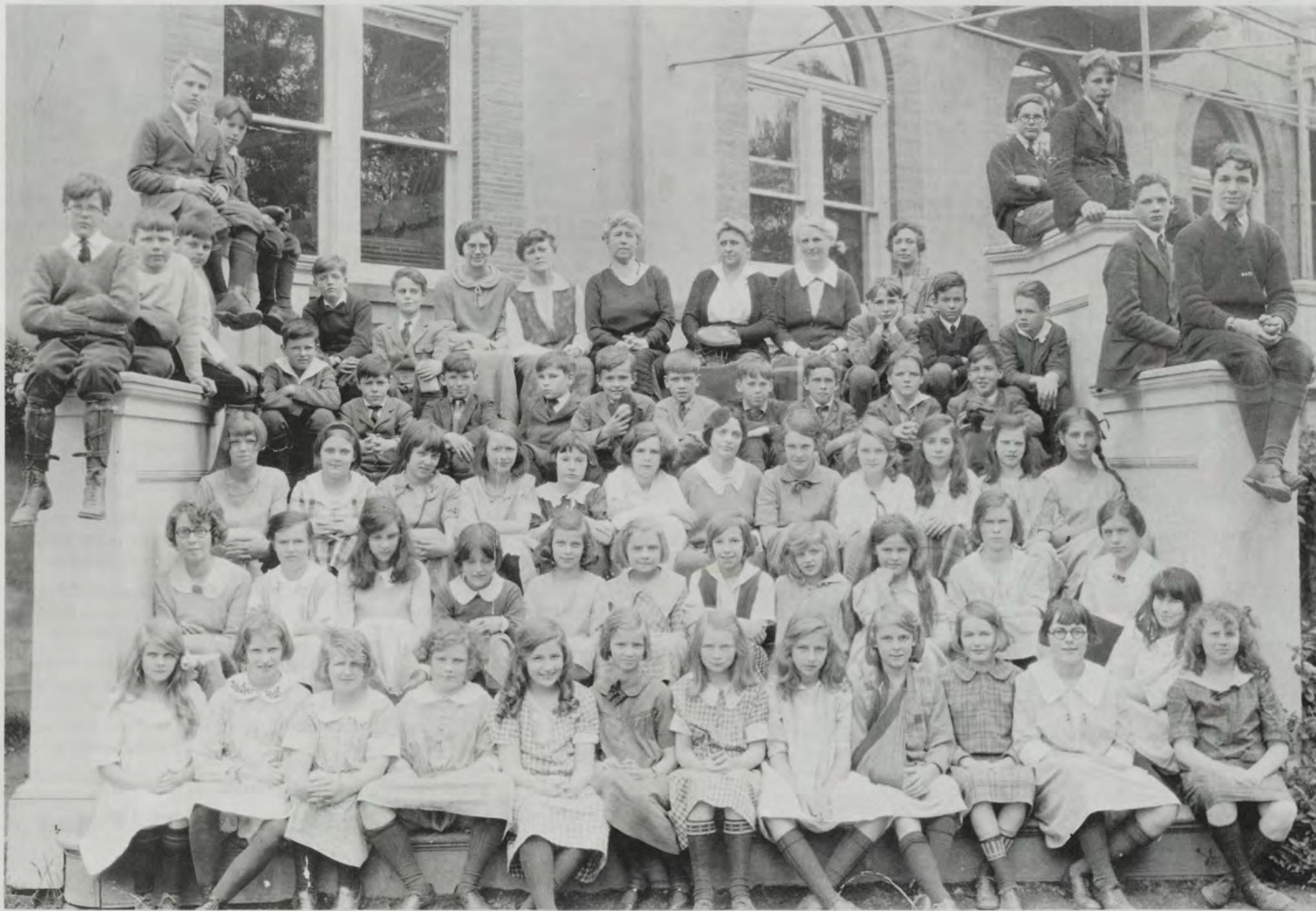
Miss Fine's School in the early 1920's