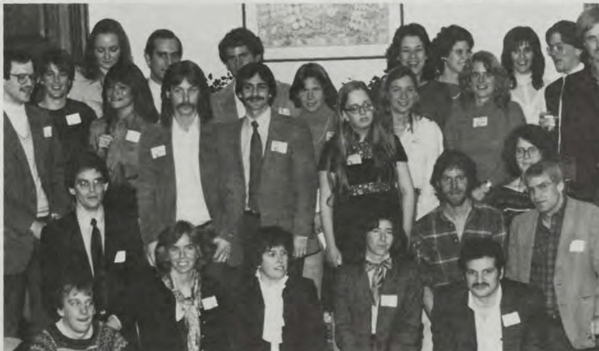
Class of 1973's 10th Year Reunion