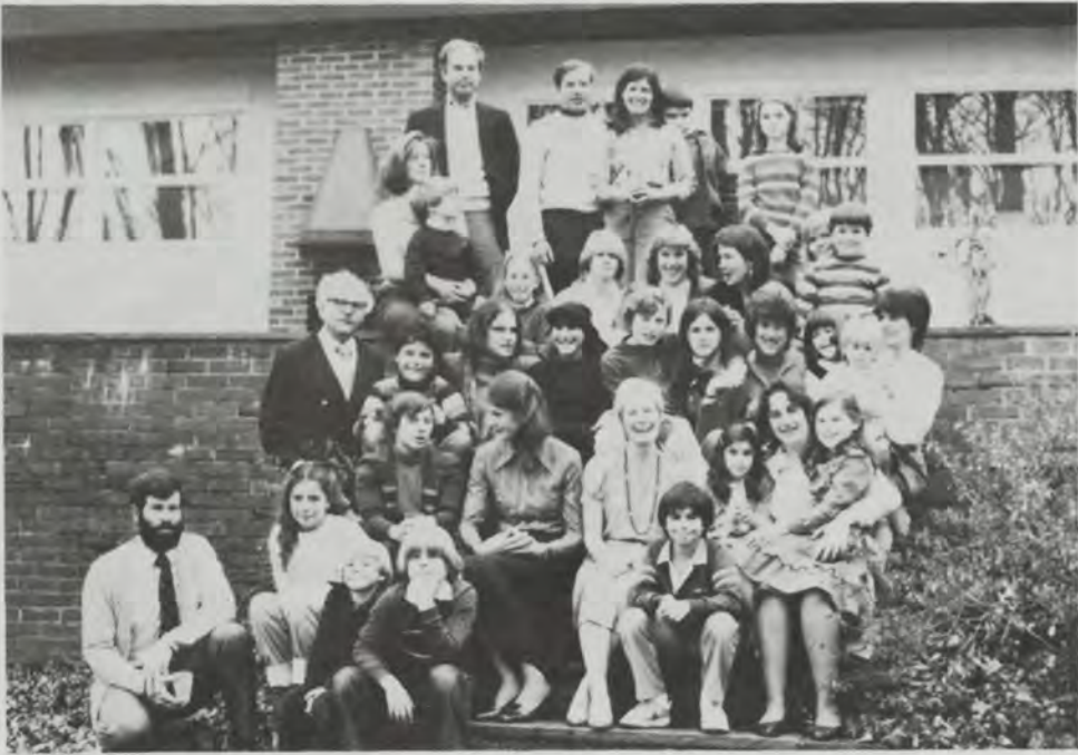
...AND THEIR FAMILIES